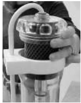
Figure 15—Unscrewing cap and removing filter